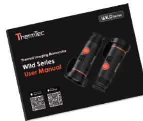
User manual (x1)